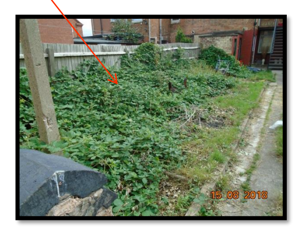
Before and after shots following legal notices served on properties/land in the ward

If you have any issues that you would like to report then please speak to the City Wardens or contact the service on www.leicester.gov.uk/myaccount